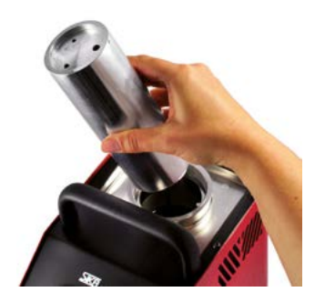
Dry block calibration