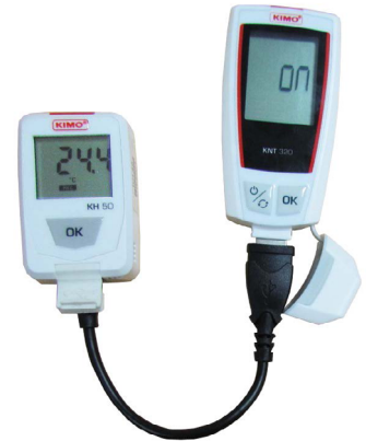
Female USB / male micro-USB adapter (reference: KNT-A)