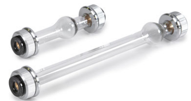
Cuvette 10 and 20 cm