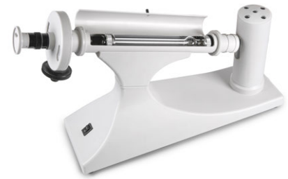
Cuvette in measuring chamber