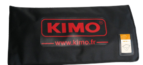
Bag for hood