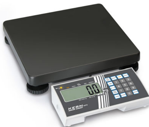
KERN MPS-M with free-standing display device