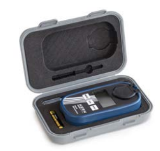
Transport and storage case