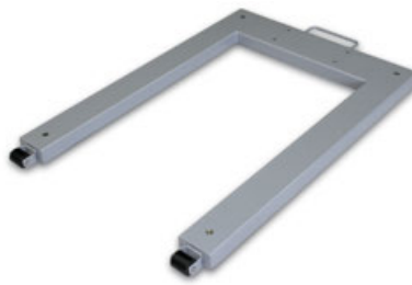
7 KERN KFU-V20/V30