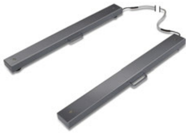
6 KERN KFA-V20