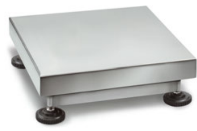
8 KERN KFP-V30