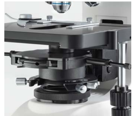
OBN-15: Mounted phase contrast condenser