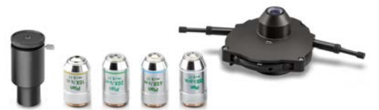
Quintuple PH universal rotary condenser with 10×/20×/40×/100× Infinity PH-Plan objectives (complete set, for OBN-15 included)