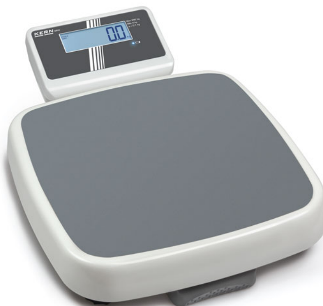
KERN MPD 250K100M

Professional step-on personal floor scales approved as a medical device and with EC type approval class III