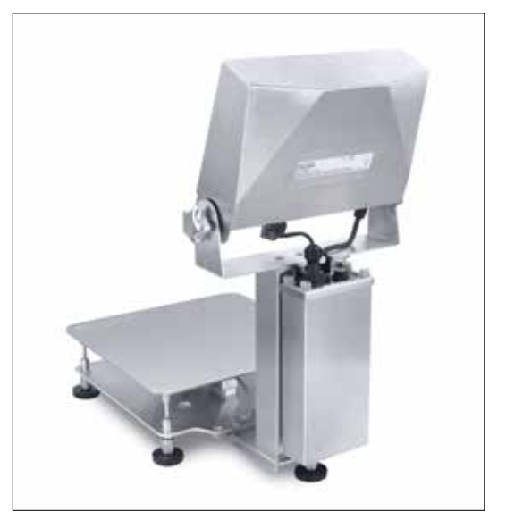
Optional External Power Bank Holder for i-D61XWE Models